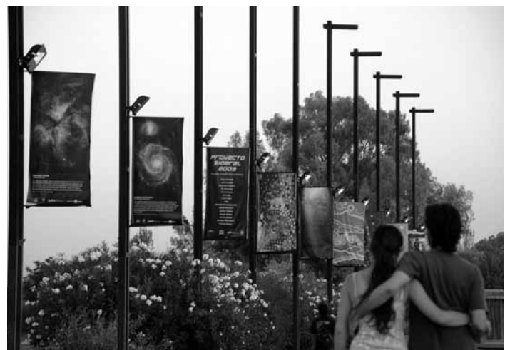
Left photo: “From Earth to the Universe” on display along Lake Geneva in Geneva, Switzerland. Right photo: “From Earth to the Universe” on display at an outdoors arts and science exhibit in Mendoza, Argentina.