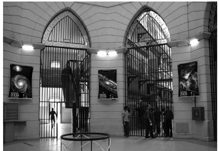
Left photo: “From Earth to the Universe” on display outside the Smithsonian’s Air and Space Museum in Washington, D.C. Right photo: “From Earth to the Universe” on display at a prison in Coimbra, Portugal